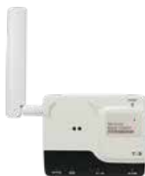
RTR500BW Base Unit (required)